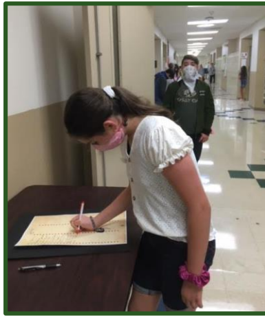
Above and below left, 6 th graders publicly sign the honor code for the first time