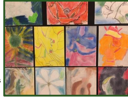
Second graders produced beautiful works during their study of artist Georgia O'Keefe.