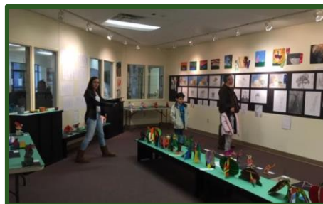
Families enjoyed touring the art galleries during the art show.