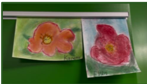
2 nd grade chalk pastels of a Georgia O'Keefe study.