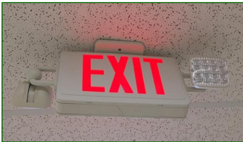
All exit and emergency lights are tested on a monthly basis by school personnel, and professionally tested, along with all pull stations, smoke detectors, horn-strobe lights, fire extinguishers, and alarm panels, annually.

As of this fall, to ensure instant communication and location of key personnel, school administrators have the ability to talk with each other via walkie-talkies from any location on campus, whether it's on the soccer field, in the upper school gym, or in the lower elementary building. The ability to communicate immediately across the entirety of the campus provides faster and more accurate responses in the event of any emergency.