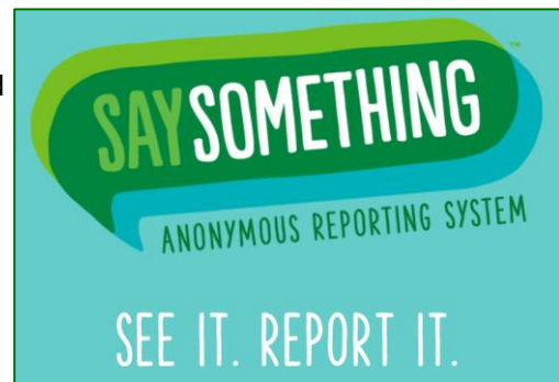
SS-ARS will be rolled out to all upper school students by December.

hotline. Through either of these avenues students may anonymously report concerns about intimidation, assaults, threats toward an individual or school, or potential self-harm or suicide. School administrators have already received training, and all upper school students will be introduced to the program by the end of November. If you'd like to know more about this program, please visit https://www.saysomething.net .