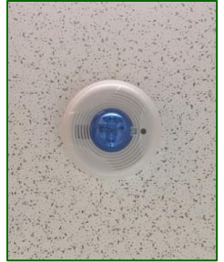
Special horn strobe lights are in all hallways to notify school personnel and students of a lockdown.

In the spring of 2019, the school formed an Internal Threat Assessment Team (ITAT), made up of school administration, Mount Airy Police Department officers, and local mental health counselors. ITAT provides help for those students who are inclined to harm others and strives to provide a safe environment on the MCA campus. While this team collects and analyzes information regarding internal threats to the school's safety and security, we depend upon local law enforcement to investigate all external threats to the school.