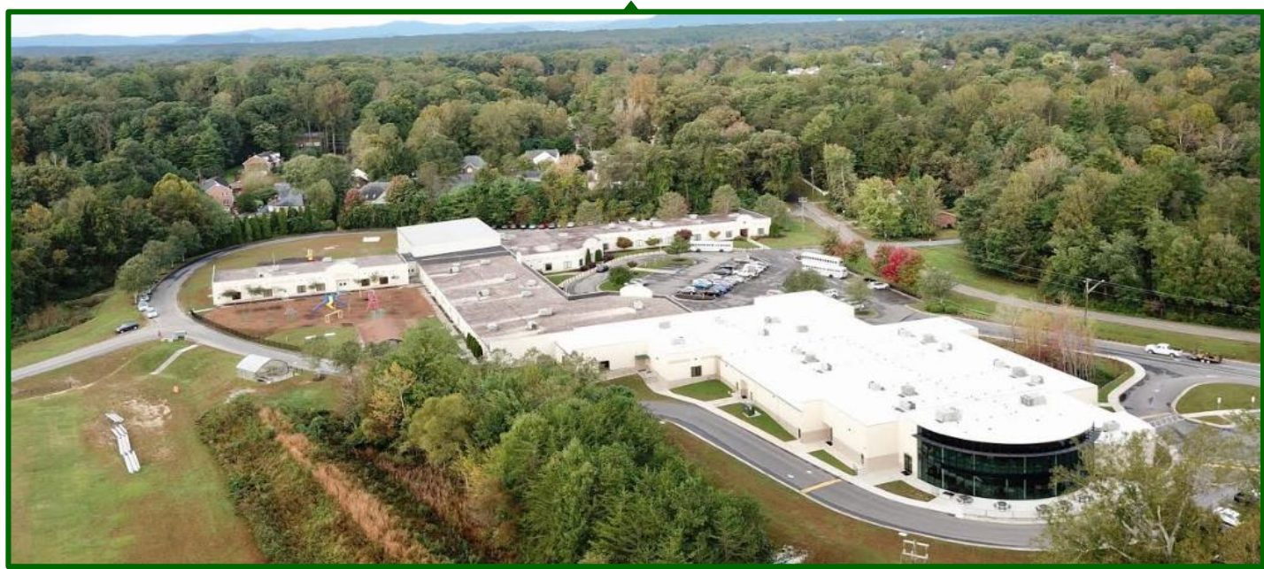
MCA, May 2018. Wing 4, which was Phase I of the high school expansion and now the 7 th and 8 th grade wing, and wing 5, which was Phase II of the high school expansion are in the foreground. The school now houses grades K-12.

In the spring of 2018, the upper school gymnasium opened, and the floor space of the newest additions nearly doubled the previous facility. Square footage of the entire facility is over 119,000 square feet, and there are over 800 students in grades kindergarten through twelve. Happy 20 th Anniversary, MCA! It's been an amazing two decades.