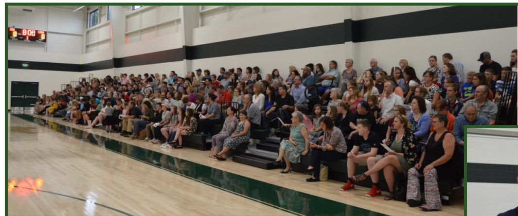
Around 300 people attended the athletic awards banquet in the new high school gymnasium.

MCA is has become a force to be reckoned with in our conference and in our state association.