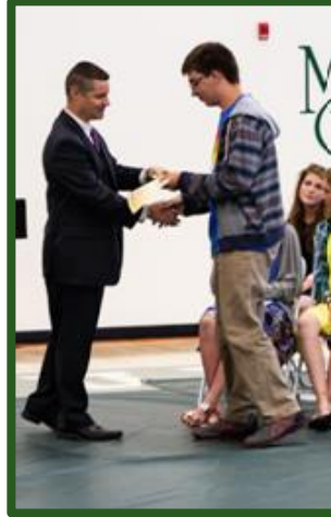
Cameron Adams History-Geography Award