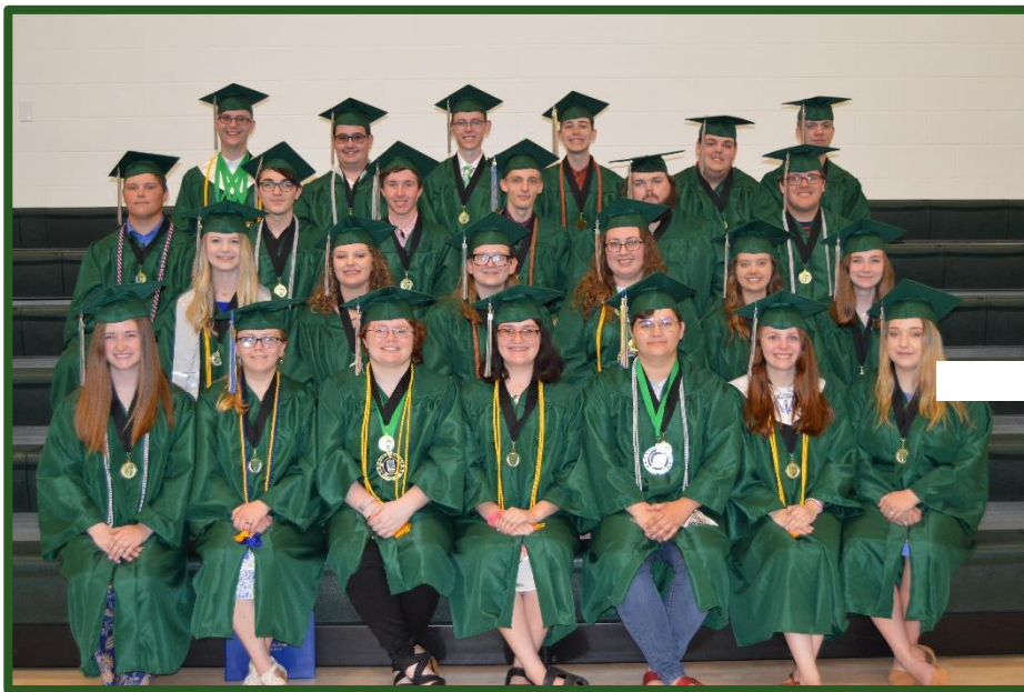
MCA Class of 2019 Graduating Class

The late spring weather was absolutely perfect on the morning of Saturday, June 1, 2019, when we held our second annual high school commencement ceremony. A large crowd convened in the upper school gymnasium to watch twenty-six seniors complete their high school education and begin the next phase of their lives.